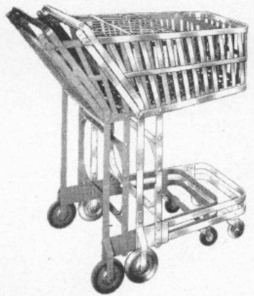
CARTS NEST COMPACTLY TOGETHER IN ONE ANOTHER