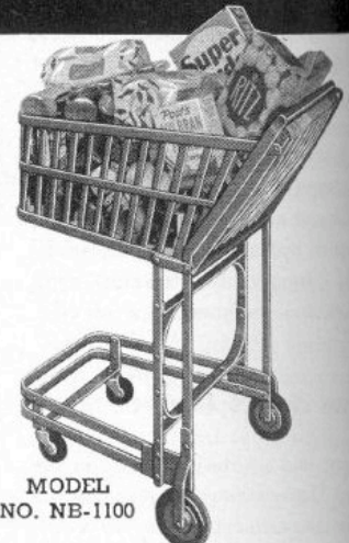
MODEL NO. NB-1100