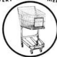
The NEST-KART with the Huge Capacity