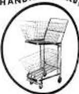
Usable with Any Type of Check-Out Counter

*NEST-KART is the copyrighted trade mark of Folding Carrier Corp. NEST-KARTS are made under U. S. Patent No. 2479530—a valuable safeguard for users.