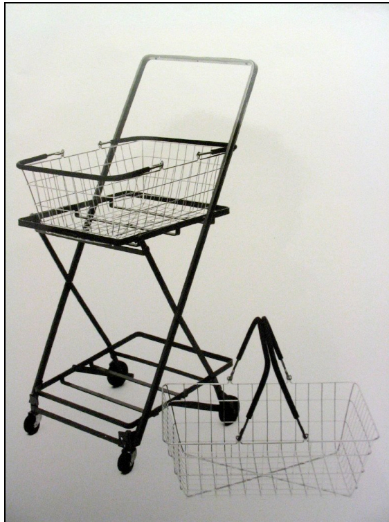
Sylvan N. Goldman's folding cart, c. 1937 ( National Museum of American History, Smithsonian Institution ) Note that the folding chair is still identifiable in the folding cart.

On June 4, 1937 Goldman placed an advertisement in the Oklahoma City press, showing a woman harassed by the weight of her shopping basket. "It's new – It's sensational. No more baskets to carry" promised the advert – without any information as to how this miracle would occur. This was a (anticipated?) form of teasing, the advertising tactic that plays on the reader's curiosity to draw attention to the message. But rather than appearing in the following week's edition, the solution to the riddle was to be found in the real world. Readers were simply required to turn into customers and to visit Goldman's shops where a hostess offered them basket carriers.