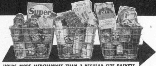
HOLDS MORE MERCHANDISE THAN 3 REGULAR SIZE BASKETS