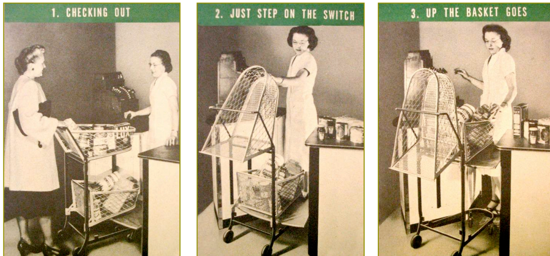
Telescope Carts, Inc. brochure (details), c.1947 “speeds check out, saves back-breaking” (TSCC, box 2, folder 3)

Despite the hopes placed in the “Power Lift”, as the system was called, and the interest in it — although this was moderated by the expensiveness of the system 29 —, Watson sold only a few copies, manufactured by him. The ingenuity, effort and care that had gone into the Power Lift seemed to have been in vain once the single-basket shopping cart came into general use. The patent application filed on 13 November 1946 was eventually withdrawn.