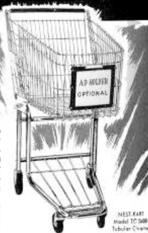
NEST-KART Model TC 5400 Tubular Chrome

Get all the facts about superior NEST-KARTS! Write us today for complete Catalog and Data Sheets.