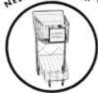
For the Average Sized Market