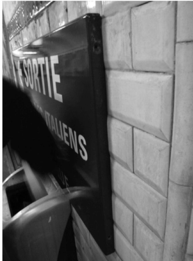
Figure 4. Shining the sign.

These two sequences show that reassemblage is more than a simple re-establishment of already-present elements. Much on the contrary, what our observation of repair sheds light on is that the boundaries between the signs and their environment are neither frozen in place nor sealed or closed. While the squares of newspaper were added to hold the PVC sheet in place in the first sequence, in the second, glue, extra screws, and, above all, metal brackets specially created for the task made it possible to reinforce the sign to the wall. During their interventions, the maintenance workers constantly consider different material sites, strengthen their composition according to their own criteria, and try to make them hold as a coherent assemblage as best they can. Instead of encountering objects with stabilized boundaries, such as a wall and a sign, they are immersed in a material flux made of multiple layers. In others words, they deal with a dense ecology of materials (Bennett 2004; Denis and Pontille 2015; Ingold 2007).