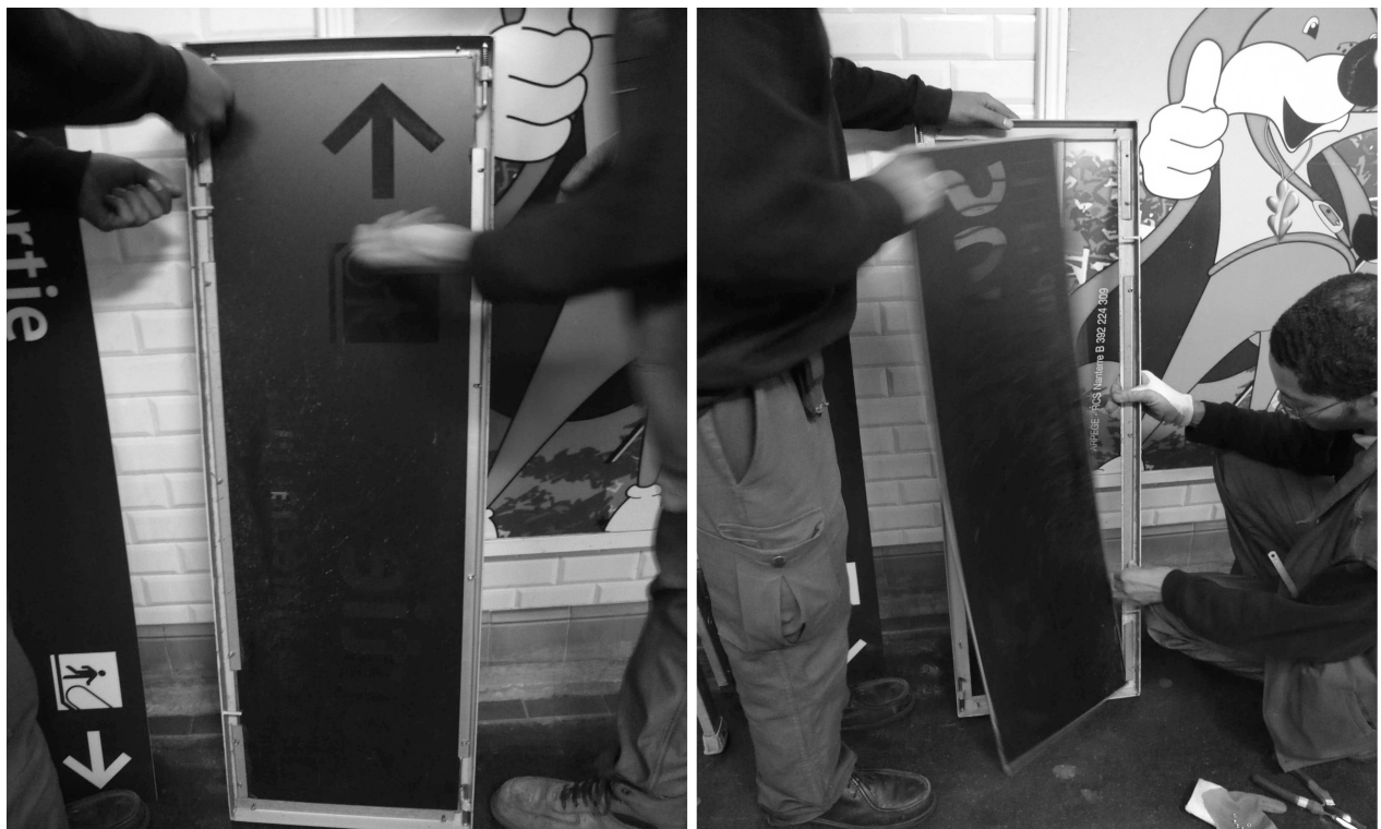
Figure 5. Removing screws.

The first step of the intervention consists in opening the lightbox in order to take its front side down. This is a delicate operation: perched on the top of a stepladder, Jonathan opens the box and puts his hands behind the frame, trying not to get burned by the fluorescent lamp and trying not to break the whole thing. Once the piece is detached and put on the floor, the next step is quite long. In order to take out the sheet itself, Brian and Jonathan have to remove manually all the sixteen small screws that hold the plaque to the metal frame (see figure 5). Once it's done, they put up the new plaque very carefully and screw back the frame. Finally, they put back the piece in front of the lightbox. After that, Jonathan tells us: “This makes no sense, 16 screws just to get at this sheet. All we'd need is a little trap along here and we could easily get the sign out without even having to open the box up, without needing to take anything out... But they don't think about that. They don't think about us.” (July 4th, 2007, Fieldnotes)