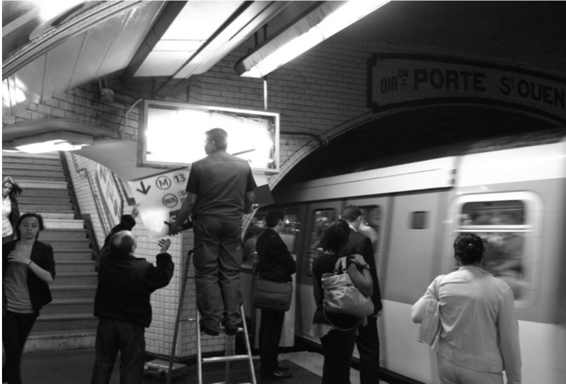
Figure 2. Sliding out the PVC sheet.